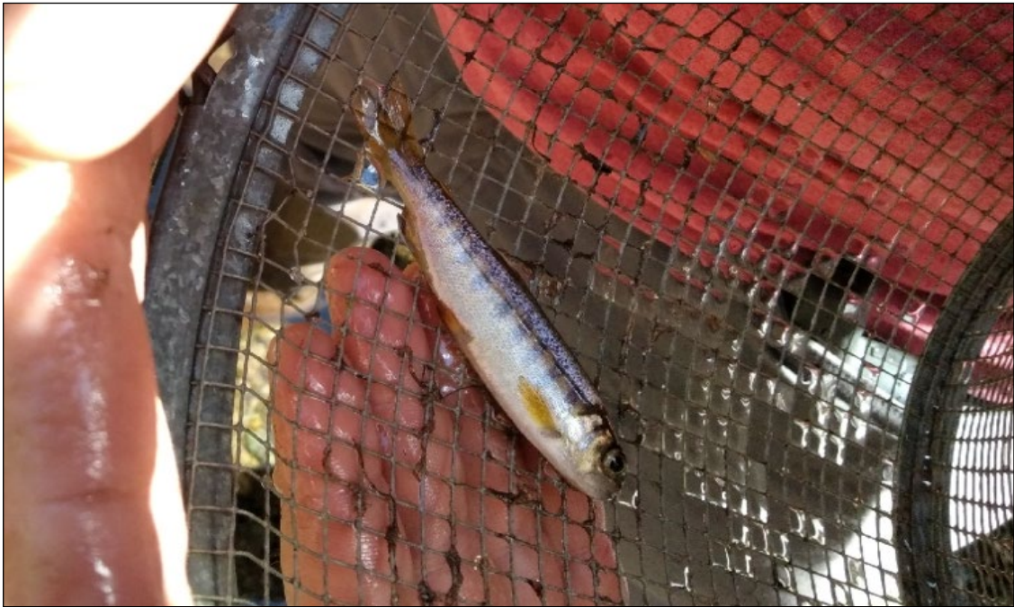
Figure 4. Juvenile coho salmon caught at waypoint 590.