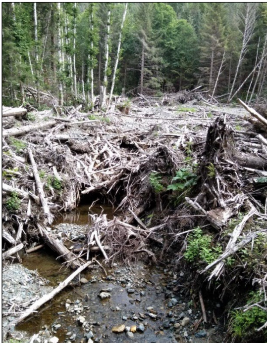
Figure 1. Landslide upstream of waypoint 590.