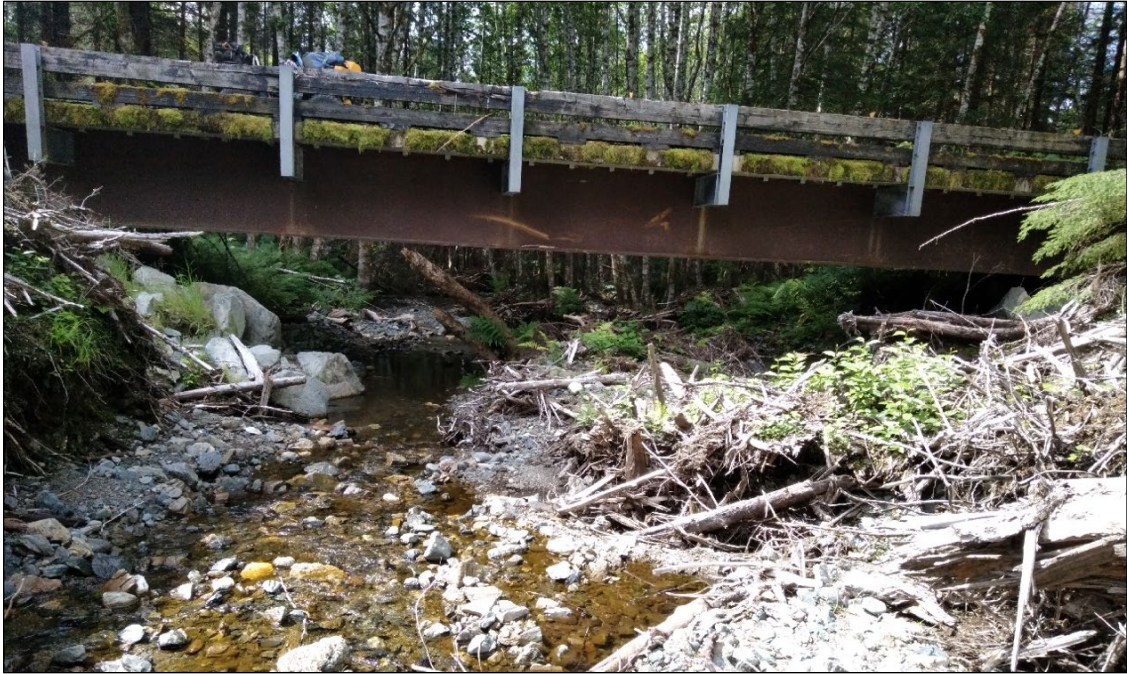
Figure 3. Downstream at waypoint 590.