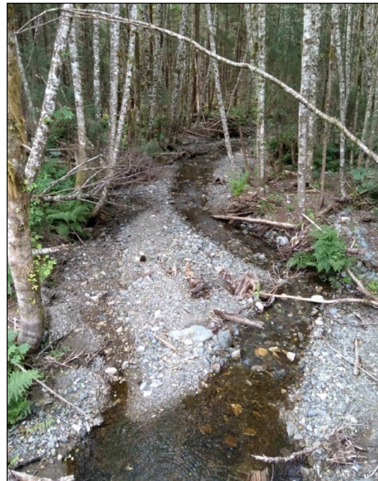
Figure 2. Downstream of bridge at waypoint 590.